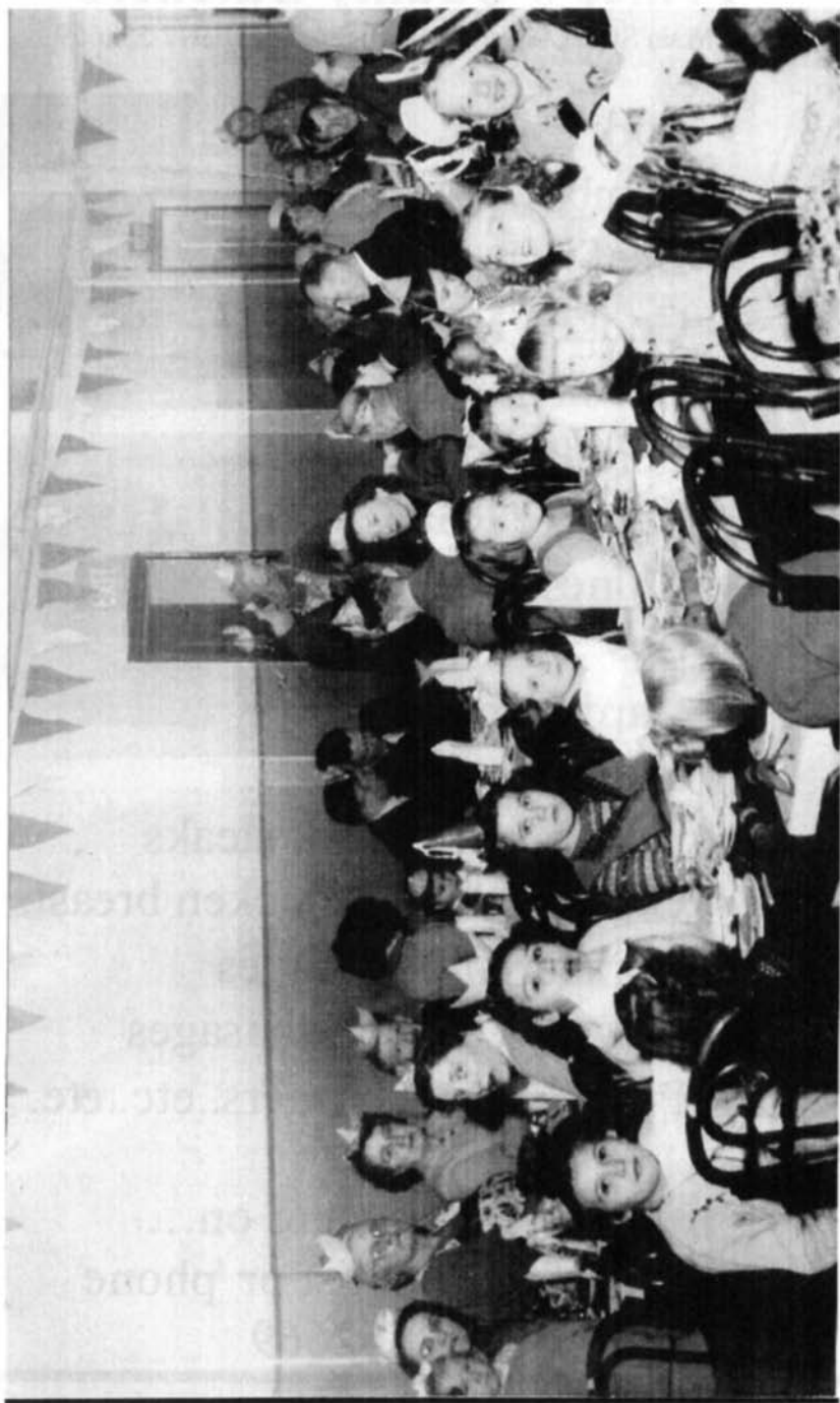
Coronation Party at the Welfare Hall